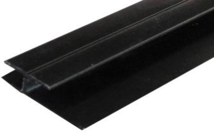
H - SPLINE

PINE Wall Panel can be affixed to the wall using H -SPLINE, as follows: