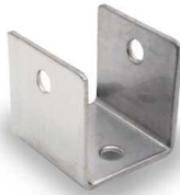
U BRACKET CLIP